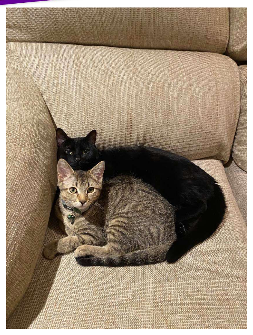
^{\wedge\wedge} our two house cats spooning <3