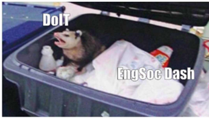
Figure 1 – Me defending my garbage