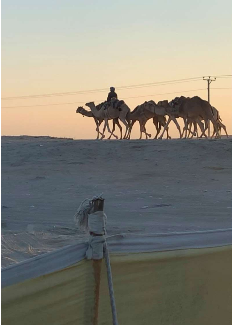
Figure 1: Camels I spotted at the beach