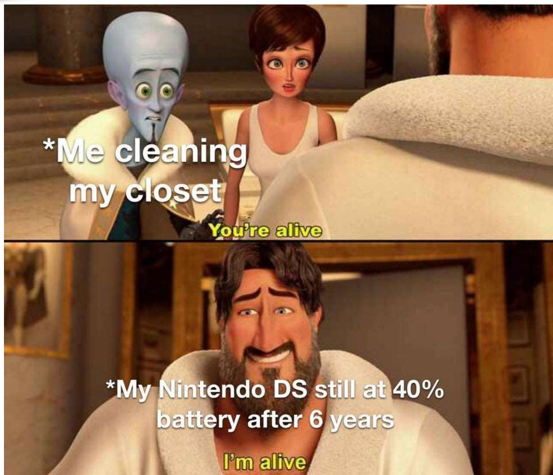
Figure 1: Reading week vibes