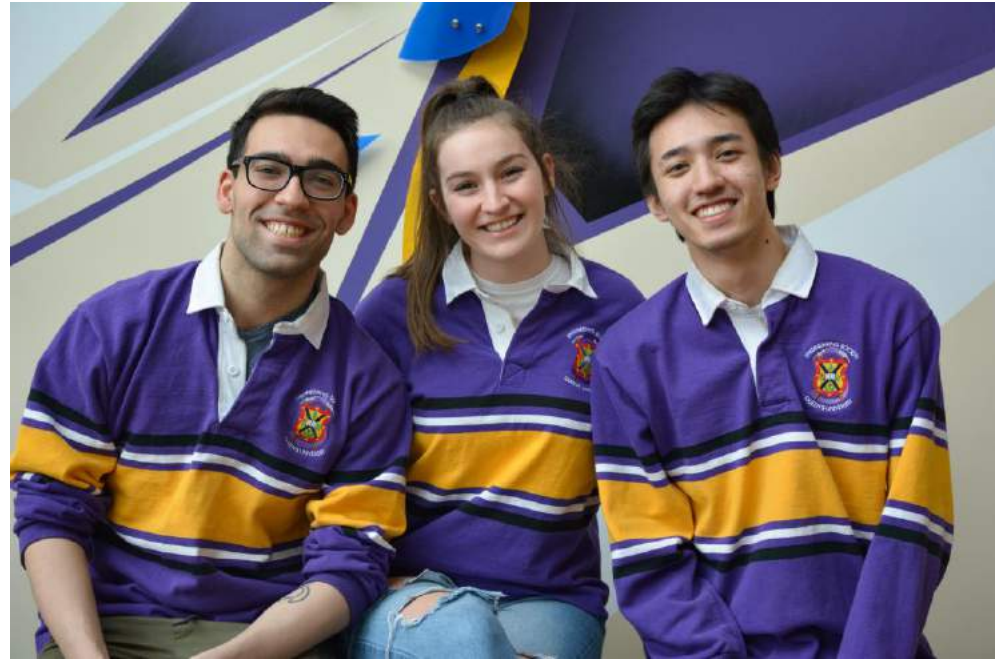
Current ED Team in 2 Months: