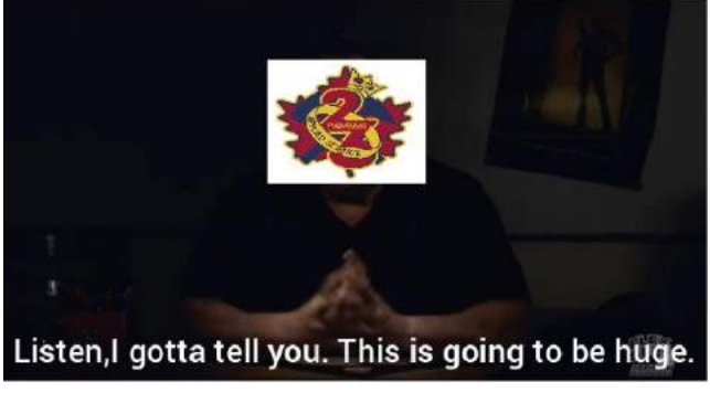
Figure 1: A meme ahead of its time.