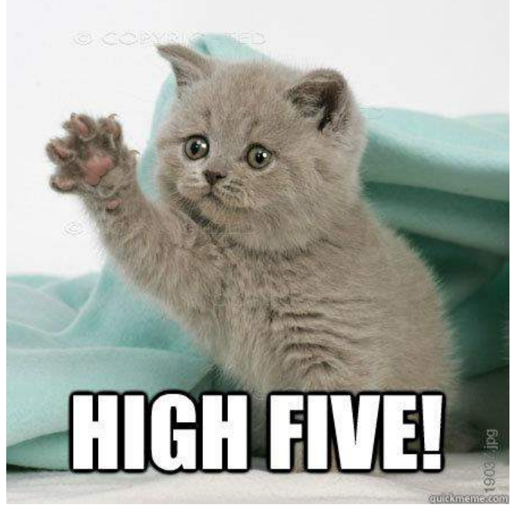
Congratulations to all the new Directors!