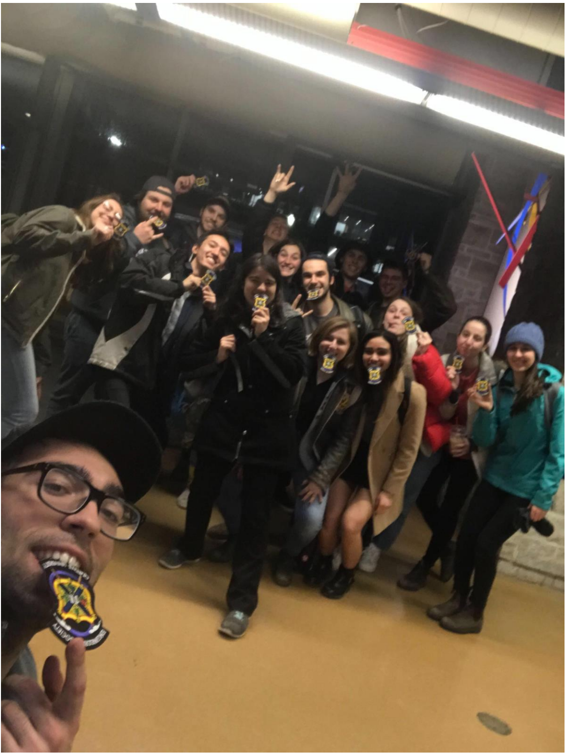
Figure 1: Almost a year ago :')