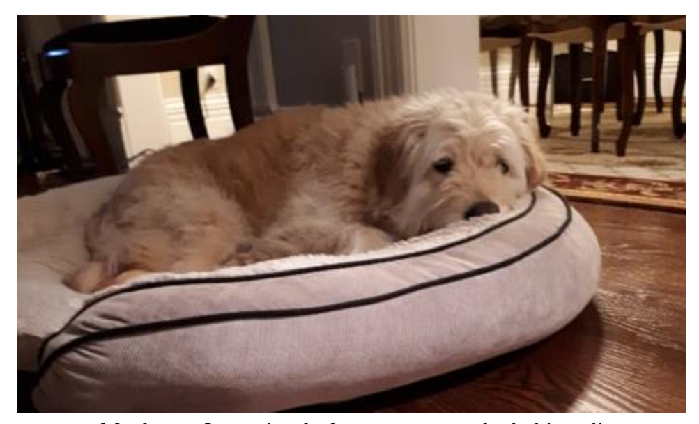
My doggy, I promise she has no reason to look this sad!