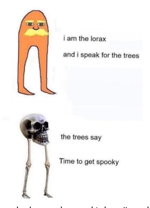
Hope you had a spooky spooktober. #spooky