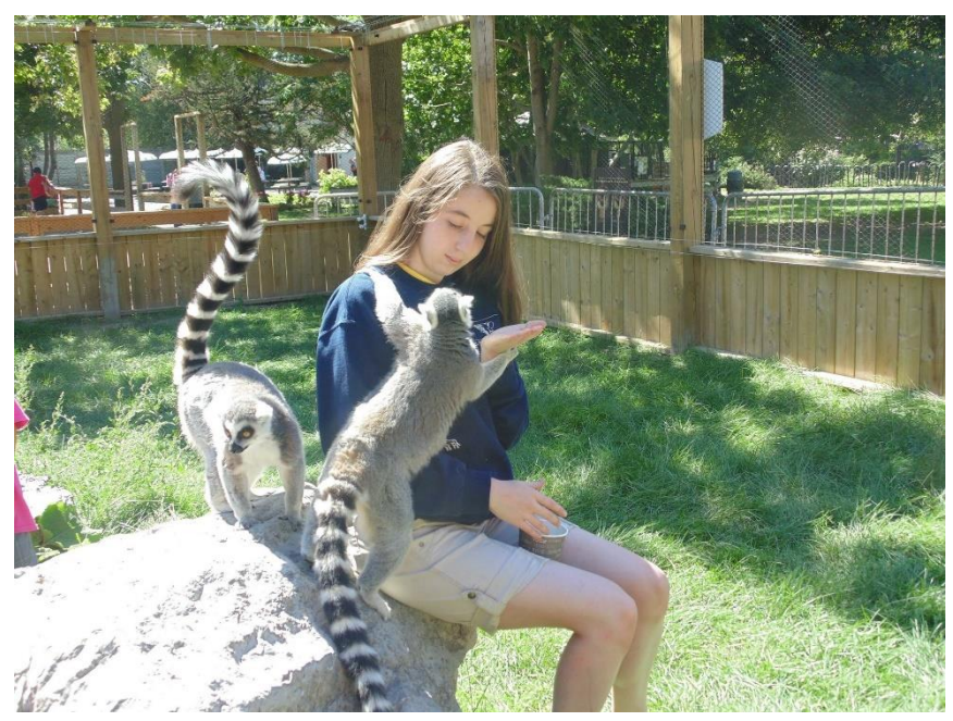
Life's Better with Lemurs ©