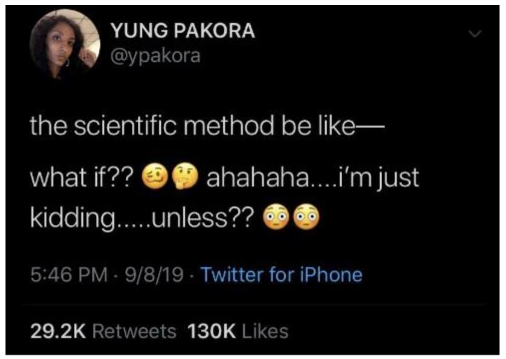
Figure 1: Science Rules