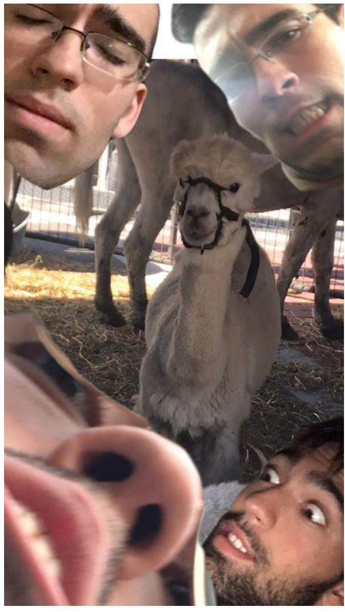
I lieek alpaca