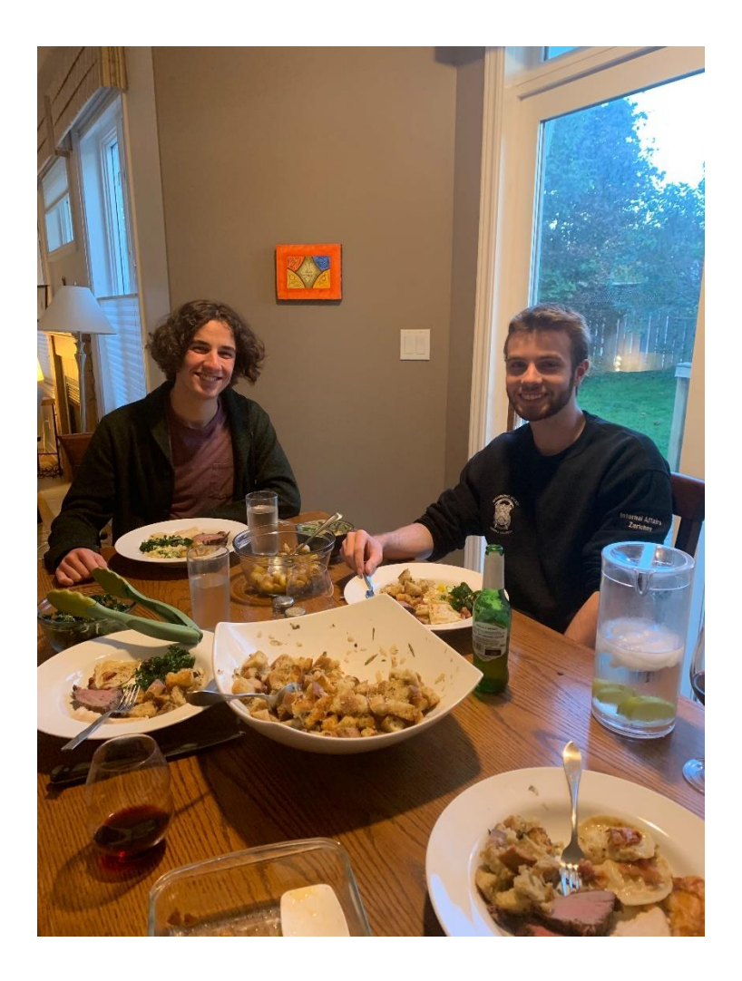
Thanksgiving dinner with the speaker ©