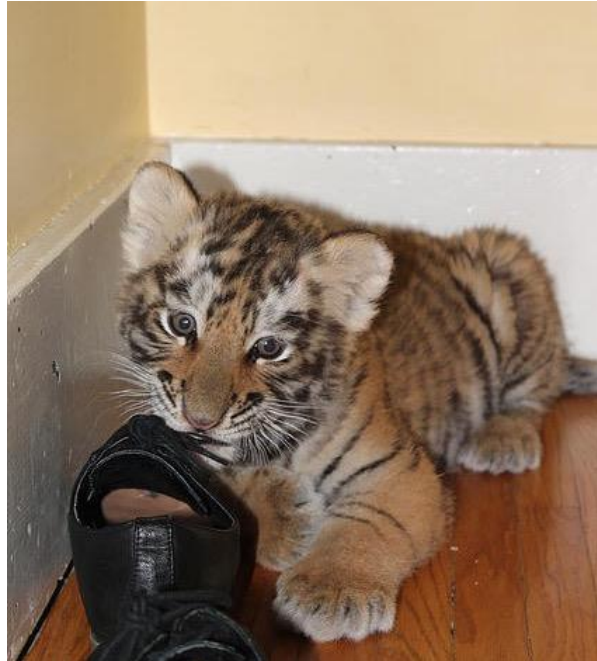
This is Luna the tiger at my house circa 2015