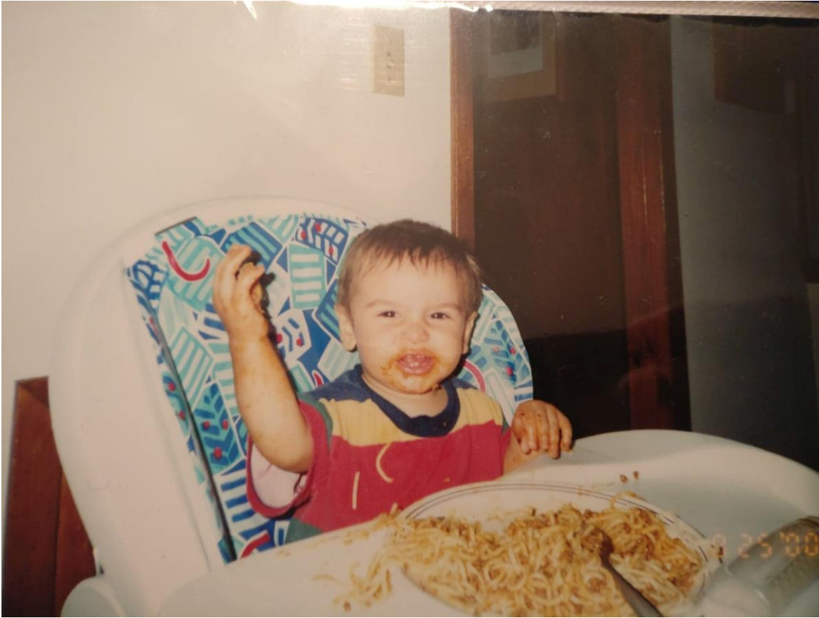
Figure 1: When the waiter brings your spaghetti before your garlic bread