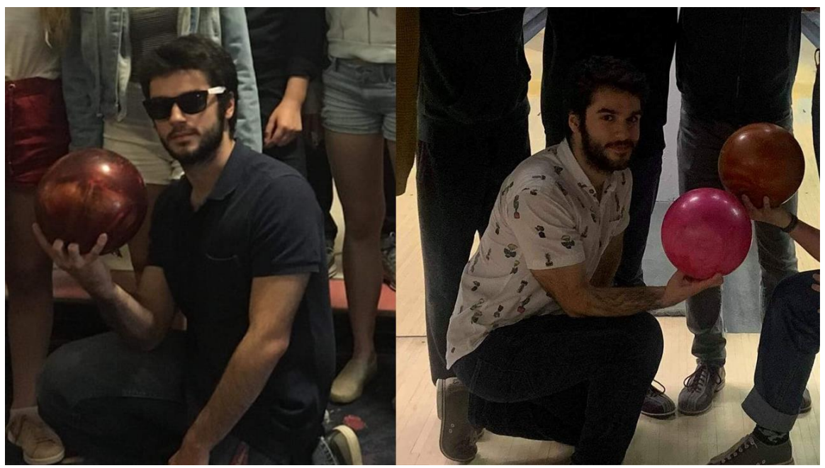
Figure 1: The Duality of Man