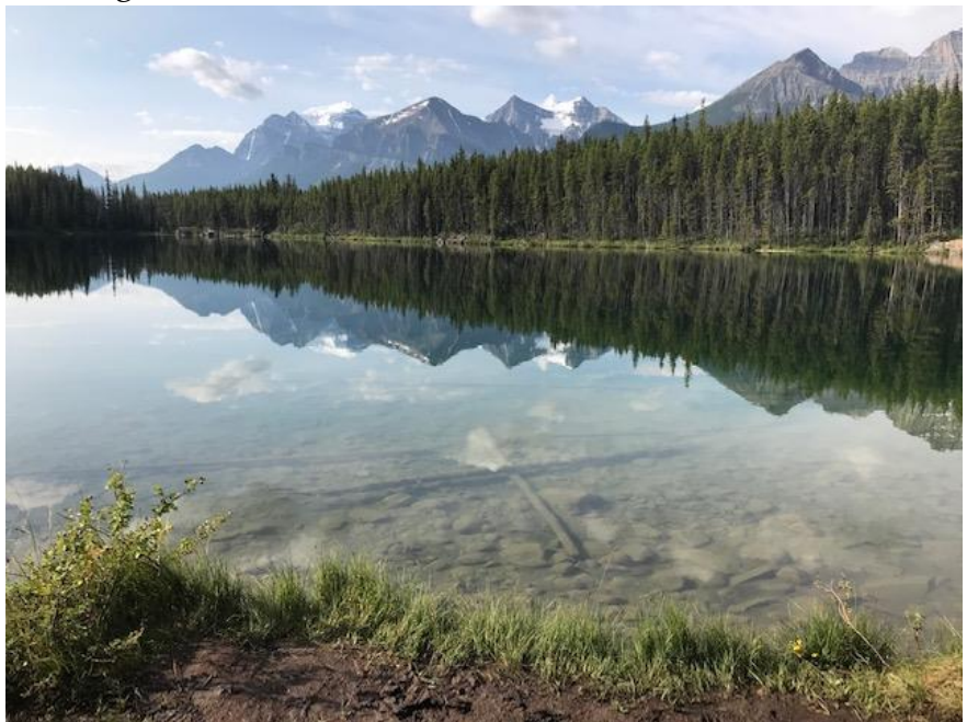
I also went to Banff National park this summer #nature