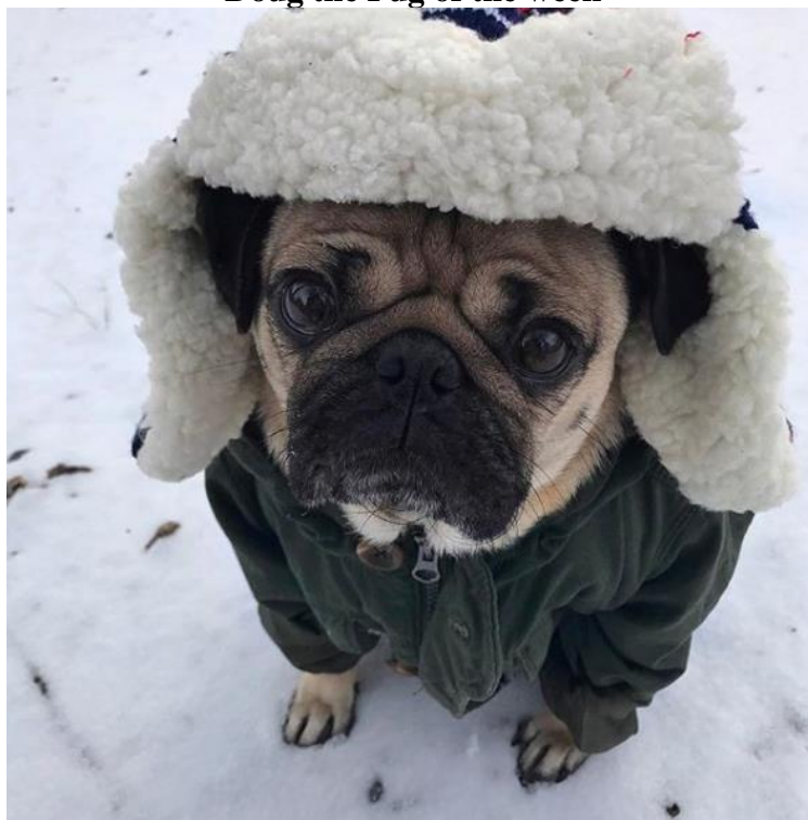
Doug the Pug of the week