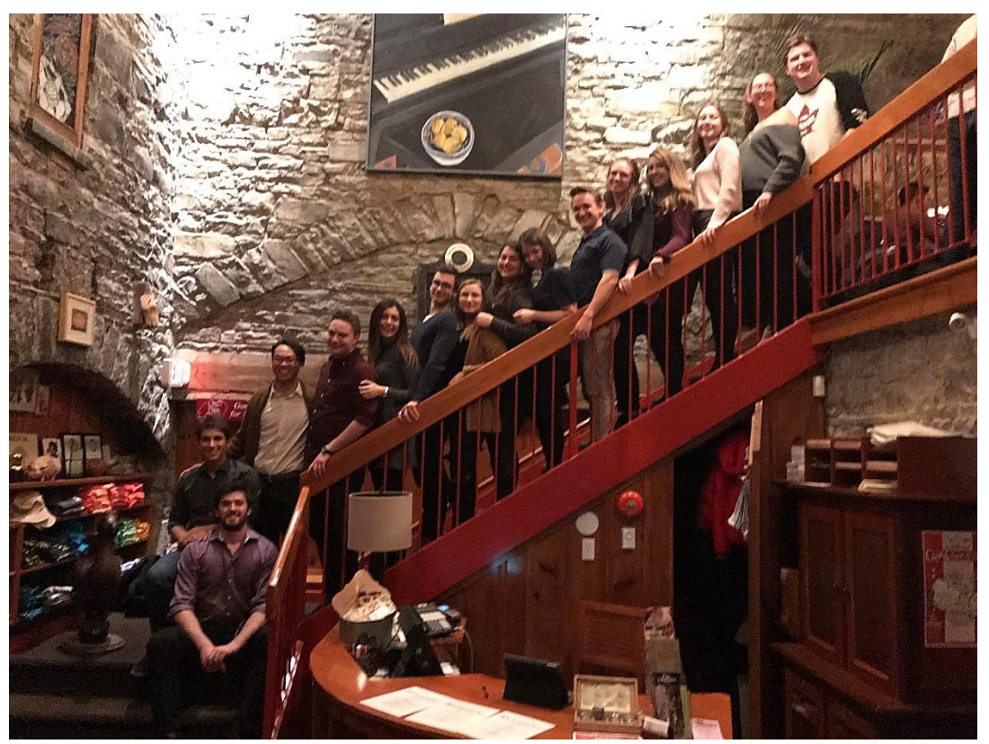
P.S. Look at all these cuties!