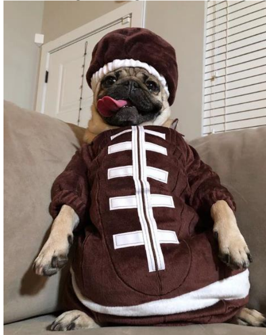
Doug the Pug of the week