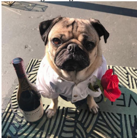
Doug the Pug of the week