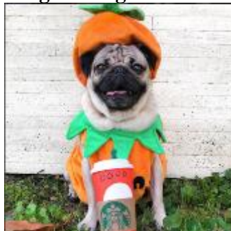
Doug the Pug of the week

Aidan "gained 5 pounds in 2 hours" Thirsk