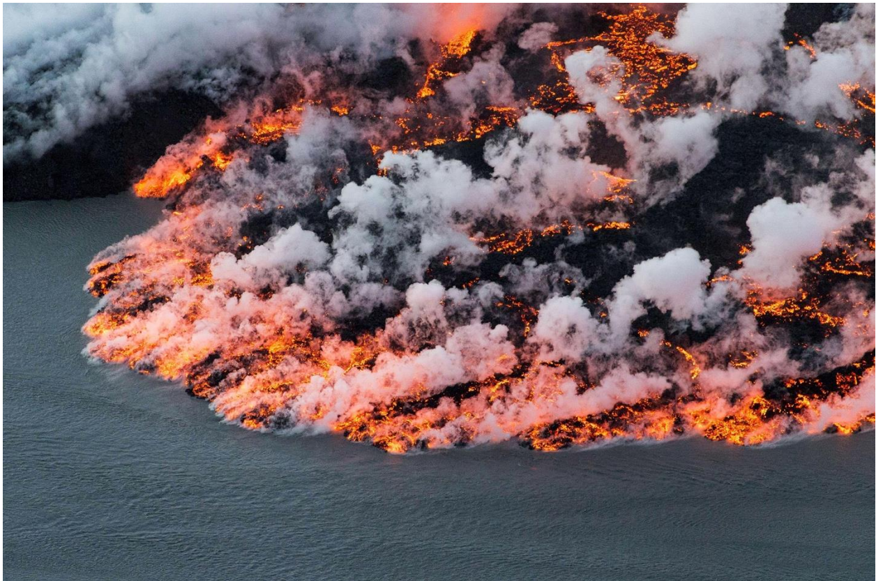
Volcanic Flow #lava

That is all for now, Evan Dressel VPSA #3