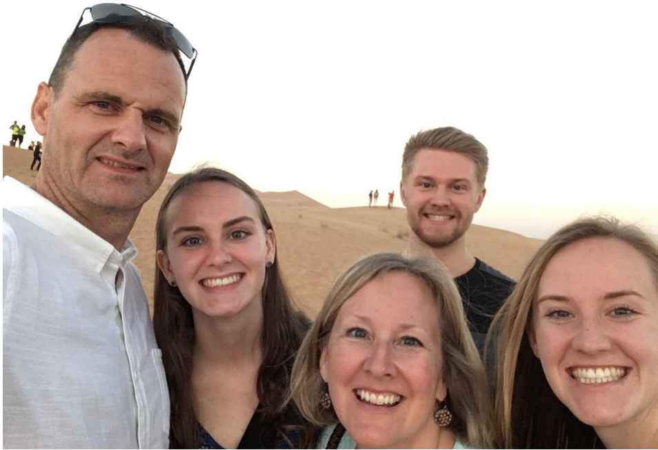
My family and I in the desert!